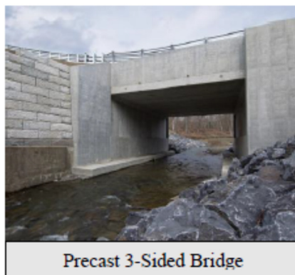
Precast 3-Sided Bridge