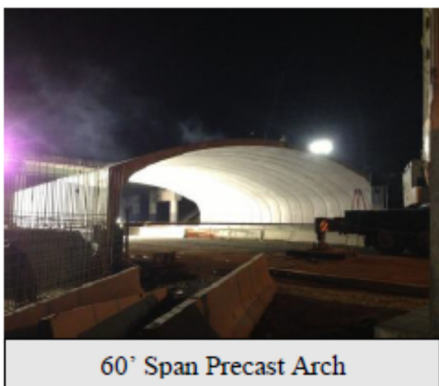
60' Span Precast Arch