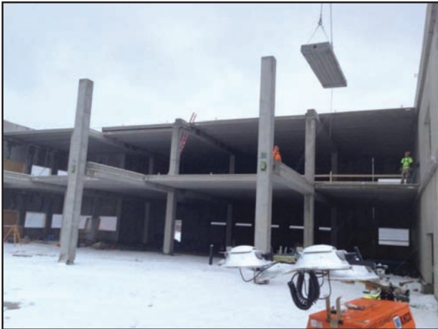
2-story Precast Columns & 24" x 24" Inverted Tee Beams