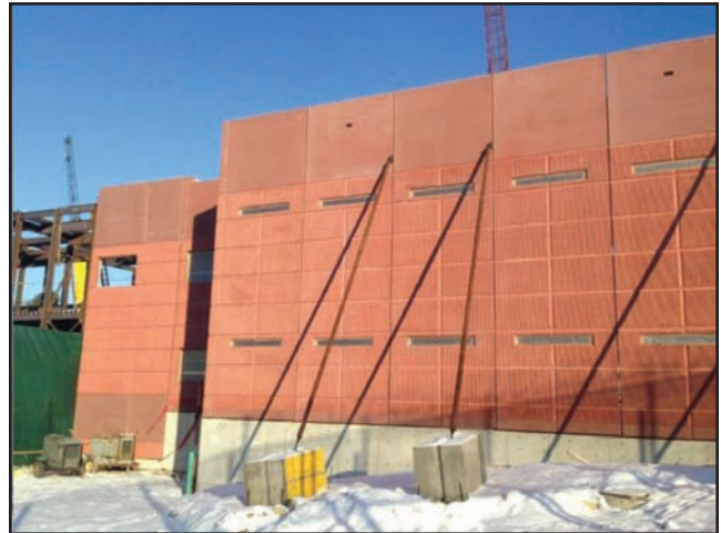
8" thick x 12' wide x 33'-6" high PC Sandwich Insulated Shear Walls

Precast beam spans of 32'0" and 10" plank spans of 28'-0" provided a wide open layout for the architect with just 2'-0" of structural depth. 12" plank at 27'-0"