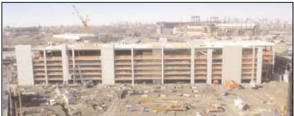
Sky View Parc garage construction nearing completion

Undergoing the final phase of fit out, this Flushing, New York parking structure was the largest garage, at the time, undertaken by Unistress, Pittsfield, MA. (They since have started an even larger one!) Built to park 2633 cars, it equated to 605,500 s.f. of double tees, typically 60' long, 12' wide, and 2'-11" deep. Code called for a 2 hour fire rating, requiring the pre-topped tee flanges to be 5" thick.