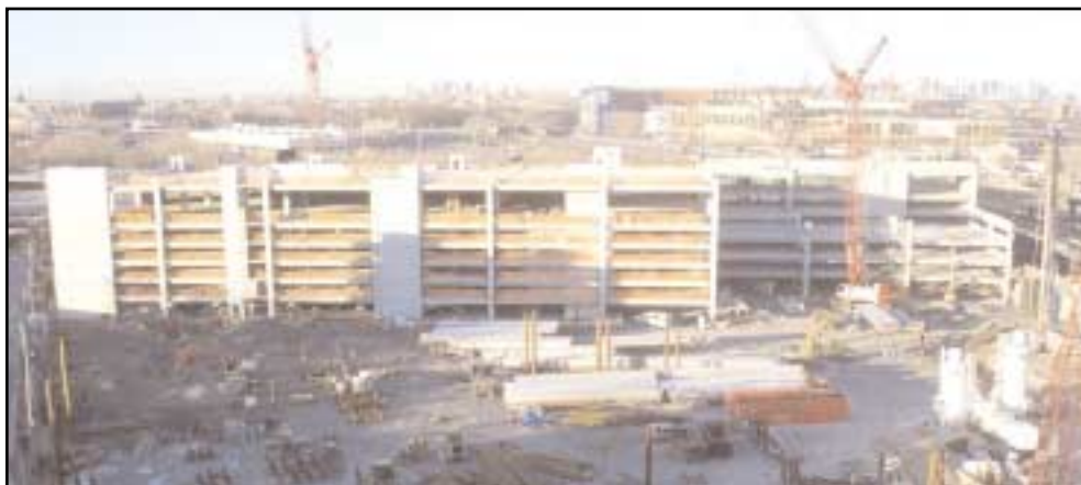
Sky View Park, Flushing, taking shape